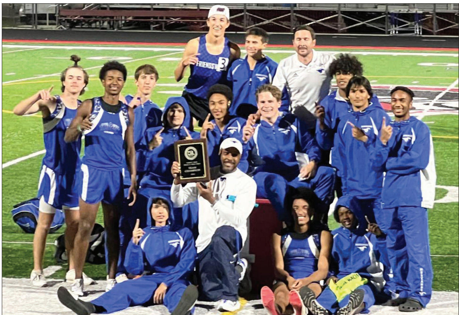
DISTRICT 22-5A BOYS TRACK CHAMPIONS - The Friendswood boys were crowned the District 22-5A track champions with 145.5 points to edge Manvel who posted 133 points for second place. Baytown Sterling (85) came in third place followed by Goose Creek Memorial (75), Texas City (66), La Porte (58), Ball High (28), Santa Fe (20), and Baytown Lee (8.5).

Heritage Gardeners will host a huge plant sale May 13-14 from 9 to 4 pm at 112 W. Spreading Oaks. The community is also invited to tour their Flower Show consisting of a Horticulture Show and Photography exhibit. For more information, follow HG on FB.