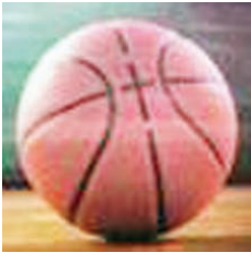
God's a gamer...