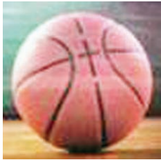
God's a gamer...