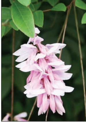
tinctoria) is one of the hundreds of plants that will be on Herit

Heritage Gardeners Garden Club is a member of National Garden Clubs, Inc. South Central Region of National Garden Chinese Indigo (Indigofera Clubs, Inc., Texas Garden Clubs, Inc., District IV of Texas Garden Clubs, Inc., and sale May 13 and 14 by Houston Federation of Garden Clubs