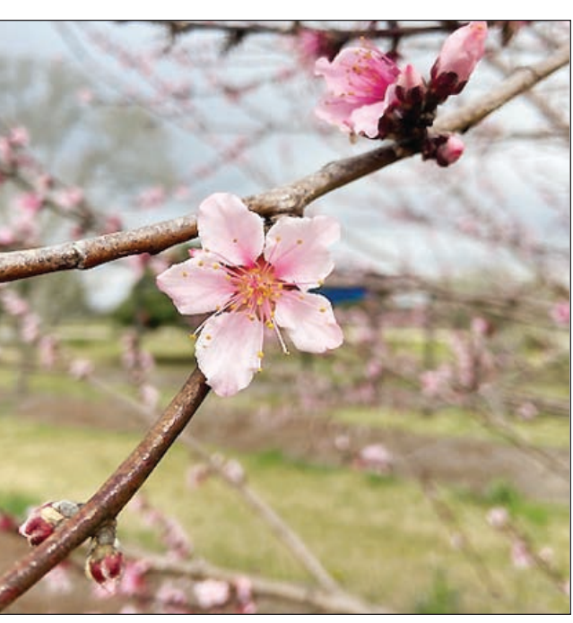
A large nectarine tree is in bloom in the Discovery Garden of Carbide Park. The garden is maintained by Galveston County Master Gardeners. It is one of the three free fruit tours planned for Saturday, May 14.