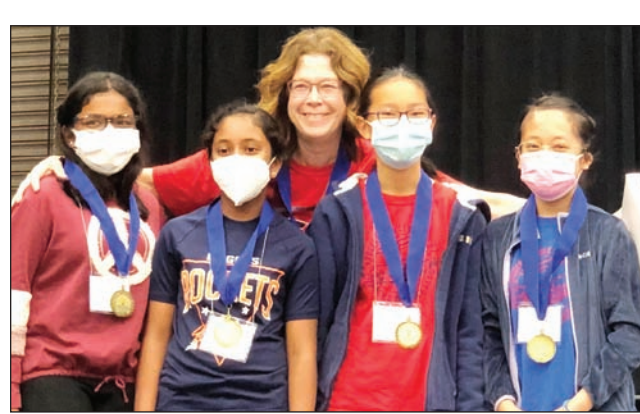
Rogers Middle School wins the Global Issue Problem Solving junior team division at the Texas FPS State Bowl.

INVITATION TO BID Sealed bids will be received by Brazoria Drainage District No. 4 (District), 4813 W. Broadway, Pearland, Texas 77581 until 10:00 a.m. on Thursday, May 26, 2022. All bids will be publicly opened and read aloud at 10:00 a.m. in the office of the District, 4813 W. Broadway, Pearland, Texas 77581 on Thursday, May 26, 2022 for the following material: 22612 - REINFORCED CONCRETE STORM SEWER BOX CULVERTS ANNUAL CONTRACT The scope of the project includes: 3x2 through 12x12 Reinforced Concrete Storm Sewer Box Culverts priced per linear foot for an annual contract. Bid Documents may be picked up without charge in the offices of Brazoria Drainage District No. 4, 4813 W. Broadway, Pearland, Texas 77581 or may be obtained from our website at www.bdd4.org . The District reserves the right to reject any and all bids and waive bidding informalities. Those bids deemed most advantageous to the District will be considered for the award of a Contract. Specifications were prepared by Brazoria Drainage District No. 4 at 4813 W. Broadway, Pearland, Texas 77581, Telephone No. 281-485-1434.