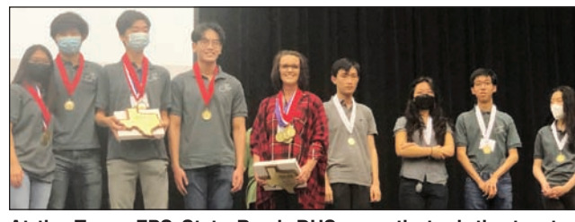
At the Texas FPS State Bowl, DHS recently took the top two spots in Community Problem Solving as well as two of the top three spots in Global Issue Problem Solving (GIPS).