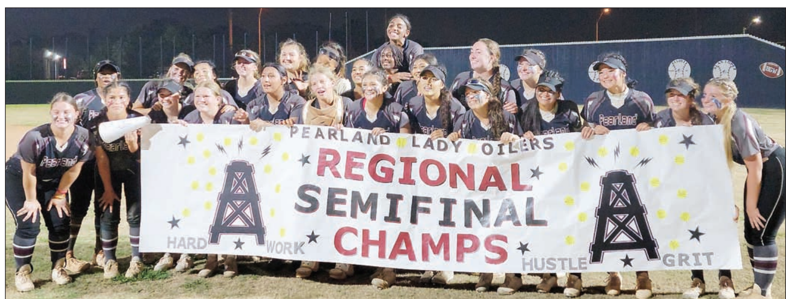
CLASS 6A REGION III SEMIFINAL WINNERS - The Pearland Lady Oilers [32-8] won the best-of-three series against the No. 6 state-ranked Katy Lady Tigers in the Class 6A Region III semifinals. Pearland advances to the 6A Region III finals where they will face the 6A defending state champions Deer Park [38-4]. The winner will advance to the 6A state softball tournament. Pearland won state in 1996 and 2010.