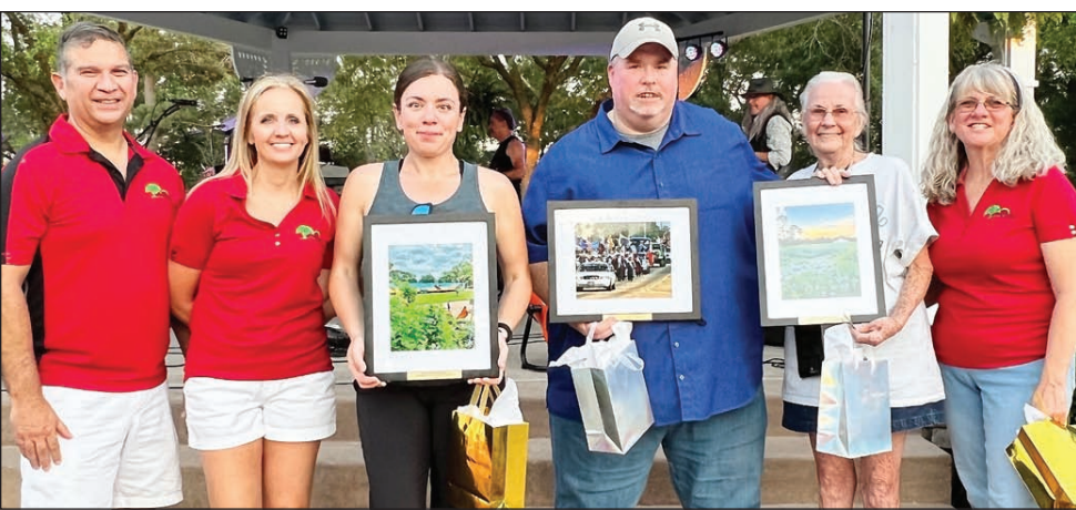
Photo winners in the KFB contest were announced June 3 at the Concert in the Park in Stevenson Park.