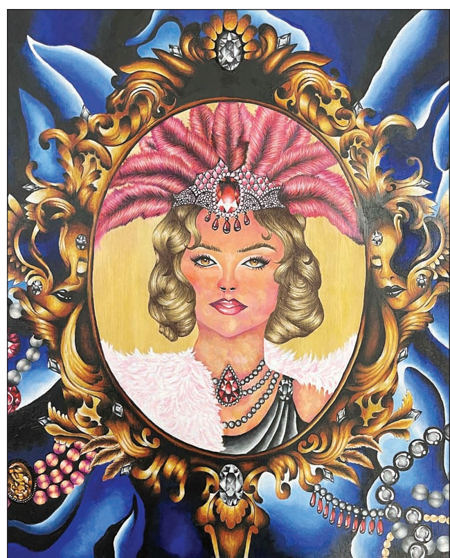
PEARLS OF POWER by Sainsha Baskshi