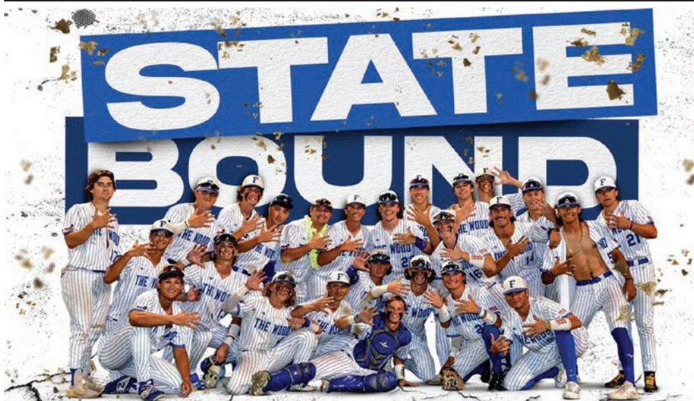
STATE BOUND! The Friendswood Mustangs have punched their ticket to the 2022 Class 5A state baseball tournament at the Dell Diamond Stadium in Round Rock. The 'Stangs swept Lake Creek 4-1 and 8-3 in a best-of-three series to win the 5A Region III title game. The Mustangs (27-9-1) will face Mansfield Legacy (32-9) at 4 p.m. on Thursday, June 9 in the Class 5A state semifinals.

To register, visit www.ci.friendswood.tx.us/200/Parks-Recreation . For more information call 281-996-3220 or email rec@friendswood.com .