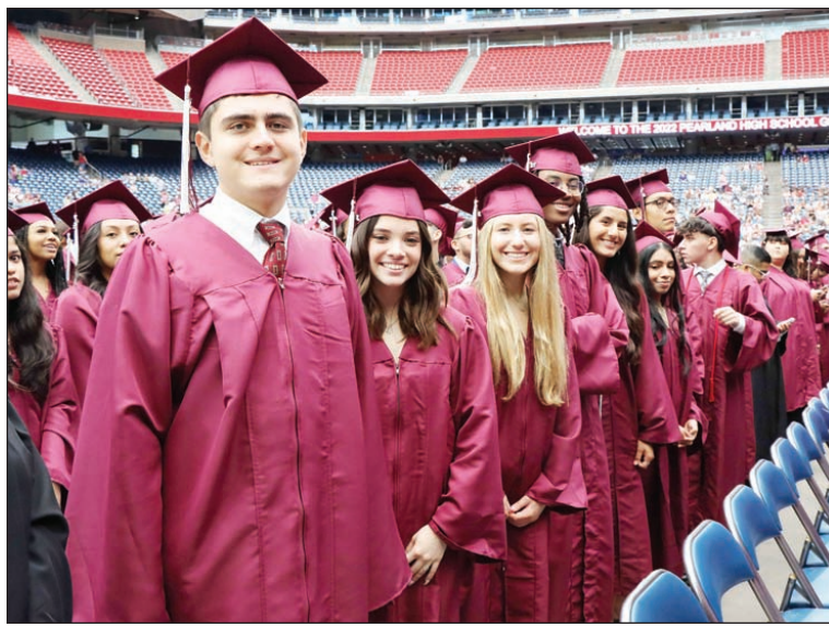
PEARLAND HIGH SCHOOL

Alvin ISD Book Bus will be at Pearland Town Center (11200 Broadway St.) from 12:30-1:30pm on Wednesday, June 15. The Book Bus is loaded with brand new books, including the 2022 Bluebonnets, 2X2, Trailblazer, and Tejas award-winning books to ensure that students can read them before the school year starts. For more information visit https://www.alvinisd.net/Page/25549 .