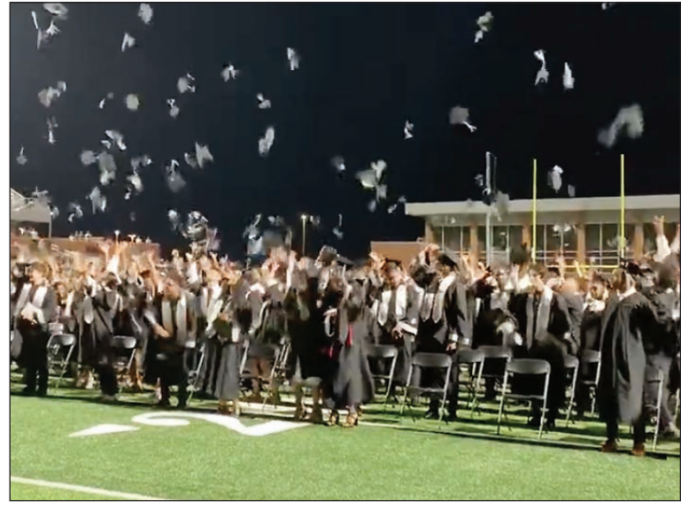
SHADOW CREEK HIGH SCHOOL