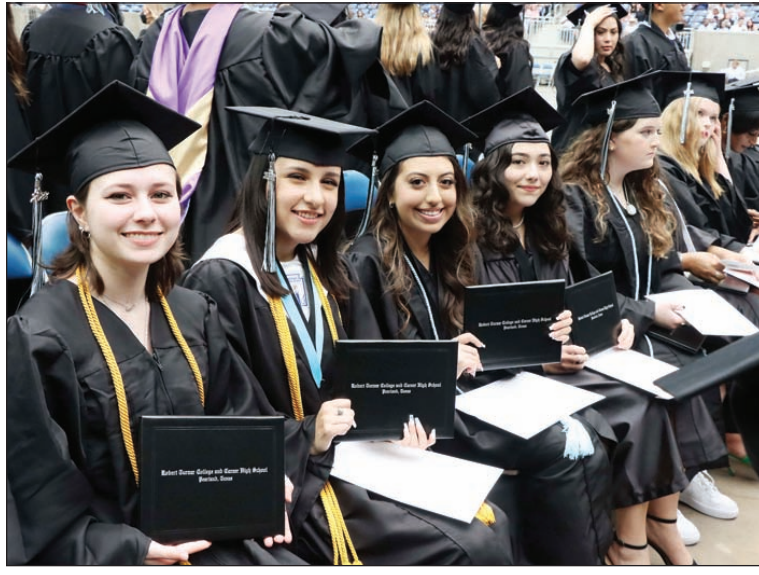
TURNER HIGH SCHOOL

Seniors in Pearland ISD graduated May 27 at NRG Stadium in Houston. Pearland High School hosted graduation at 9 am, Dawson High School at noon and Turner High School at 3 pm. Shadow Creek HS students held their graduation on Friday, May 27 at Freedom Field in Iowa Colony.