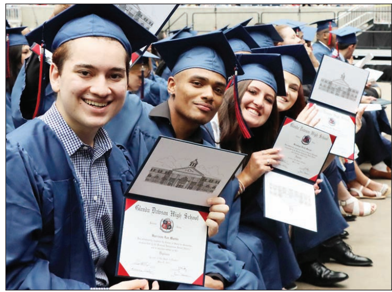
DAWSON HIGH SCHOOL