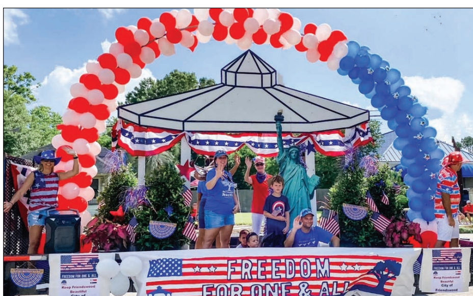
Best Overall winner for 2022 was the Keep Friendswood Beautiful float.