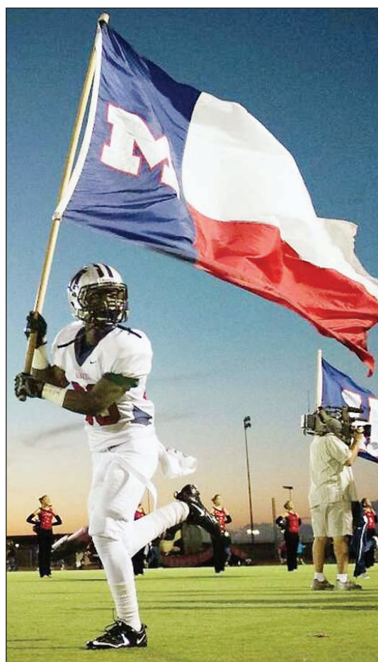
READY TO TAKE THE FIELD - Manvel is favored to win the District 10-5A Div I crown in 2022 and they will be ready to charge on the field of competition.