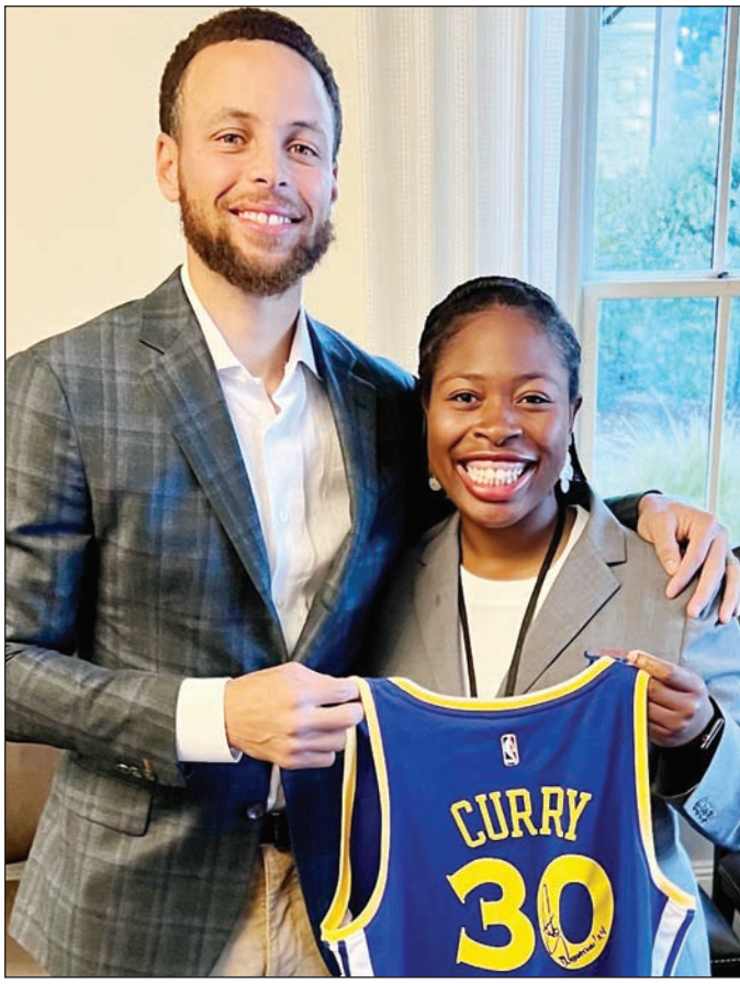
KENDALL JACKSON WITH NBA GREAT STEPHEN CURRY