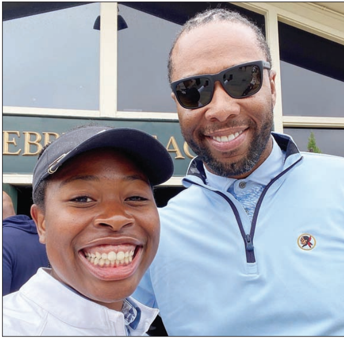
KENDALL JACKSON WITH NFL LEGEND LARRY FITZGERALD