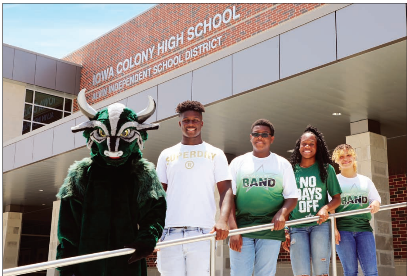
Future Iowa Colony students stand proud in front of their new school with their mascot, Blaze the Bull.