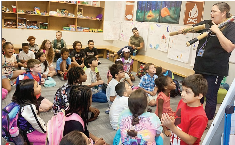
Students learn new ways of learning during Alvin ISD's Camp Read-a-lot.