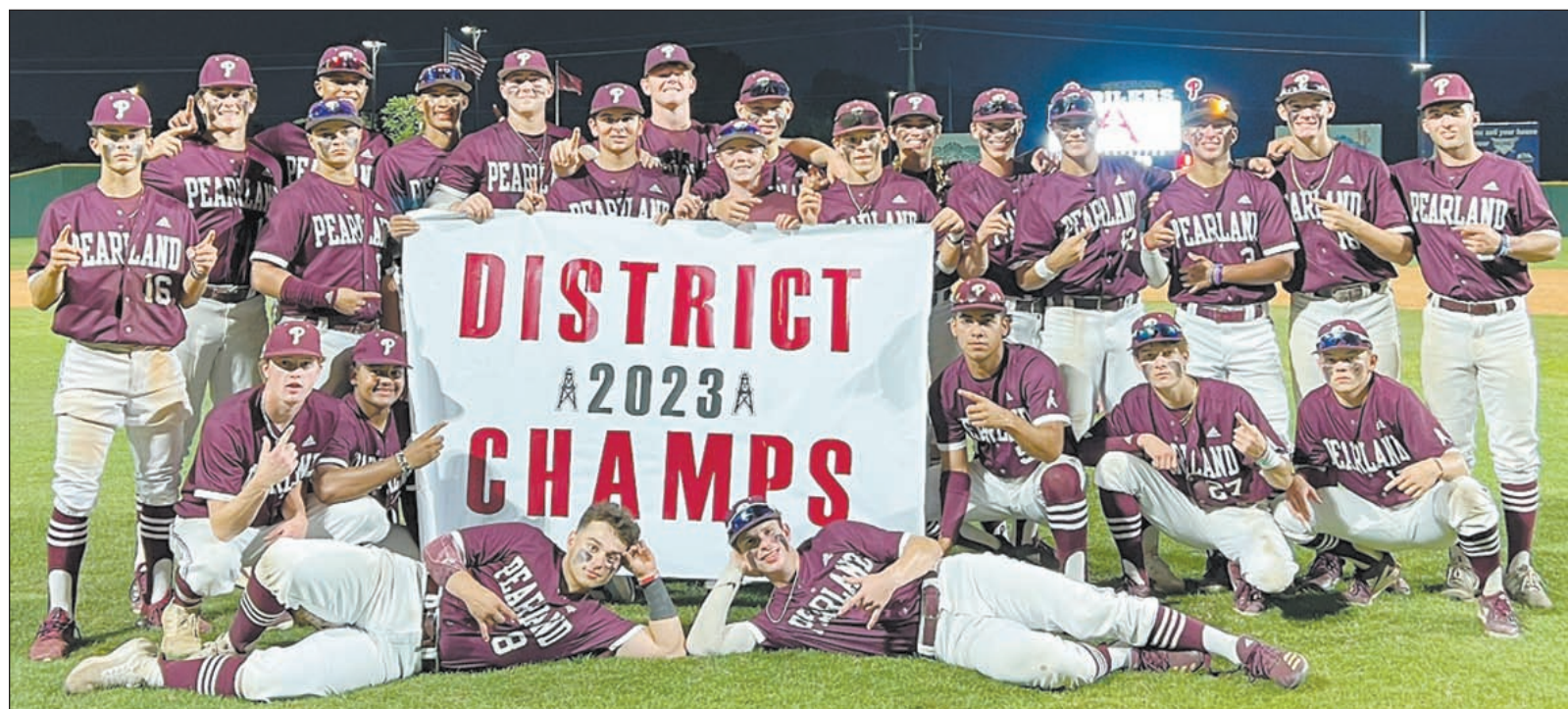
The No. 1 state-ranked Pearland baseball team (25-5) recently claimed the District 23-6A championship for the second straight year with a sweep over the Strake Jesuit Crusaders. The Oilers hope to make a deep run in the playoffs with the ultimate goal to advance to the 6A state baseball tournament.

E-mail: drdavidavis@yahoo.com www.reporternewsports.com Twitter: @drdavis111