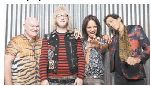
Big Daddy Band will perform on May 19

Eagles Tribute on June 30. This will be the last concert for the season and will be sponsored by Dynamic Construction.