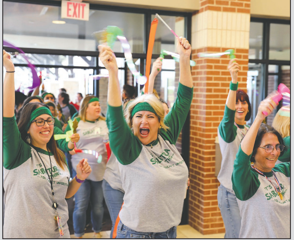
Sablatura Middle School staff celebrate the beginning of a new school year at Pearland ISD's annual convocation held on Aug. 8.