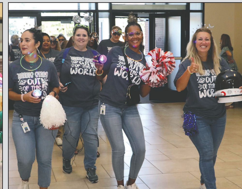
Staff from CJ Harris Elementary cheer and dance for the new school year ahead at Pearland ISD's annual convocation held on Aug. 8.