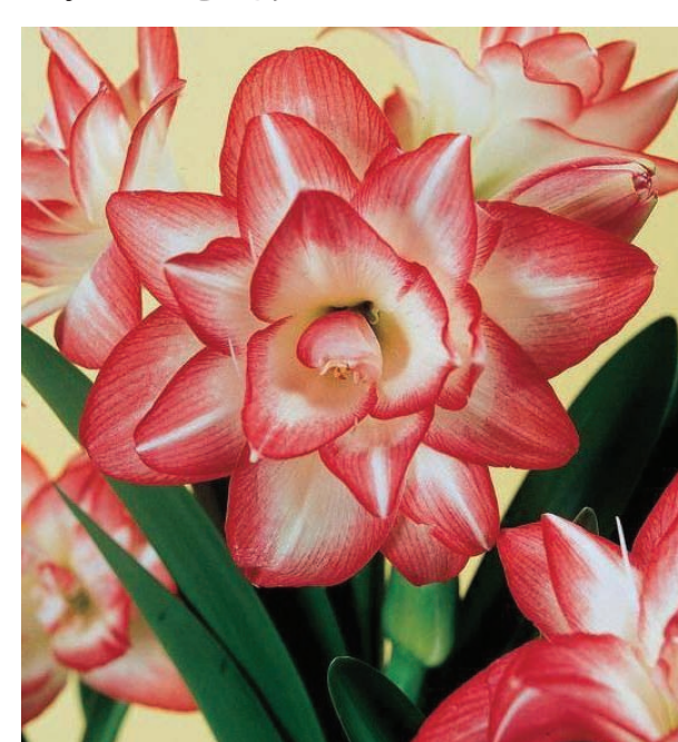
Blossom Peacock A popular DOUBLE in bloom and color