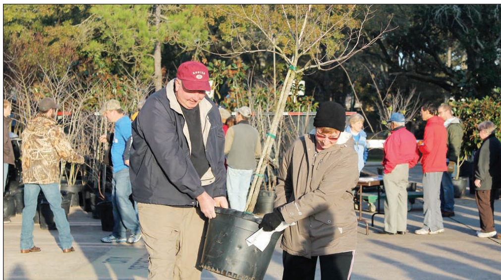
KFB members are preparing for Friendswood Arbor Day where 100 trees will be given away free to city residents.