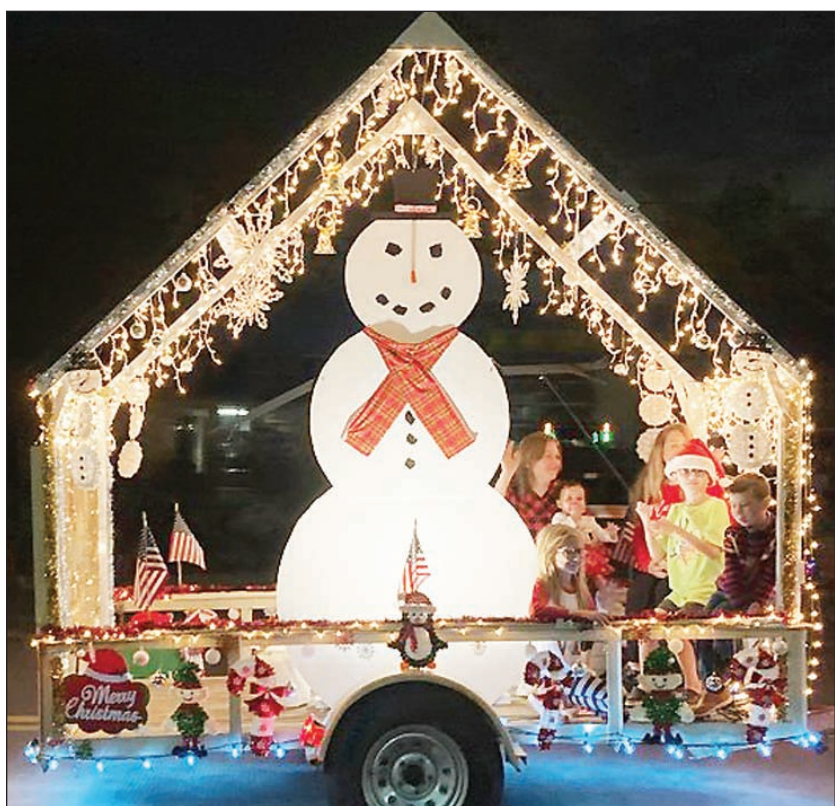
Mr. Snowman float won the Most Spirited Award.

The Christmas Season has officially begun in Friendswood. Santa in the Park, the Flapjack Fun Run, snow (!), and the lighting of the tree in Stevenson Park as well as one at the Frank J Brown Museum all held recently provided much fun for family members of all ages.