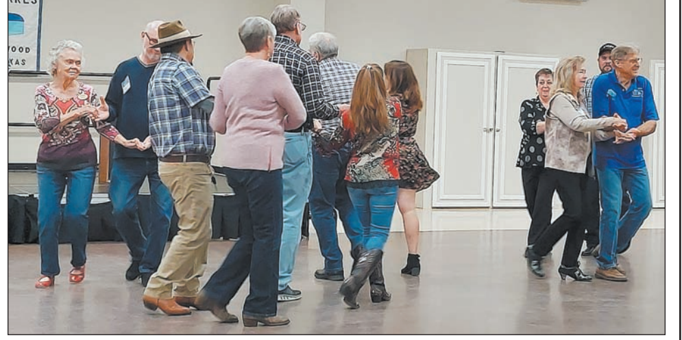
Friendswood's Hanger Squares keep things moving during a recent beginner class held at Jones Hangar, a former airplane hangar now owned by the city and used for recreation.

Houston Metro Go Texan Committee -NASA/ClearCreek/Friendswood Subcommittee presents the 56th Annual Fashion Show and Luncheon on Friday, Feb. 17 from 11am to 5pm at the Lonestar Flight Museum, 1551 Aerospace Ave. in Houston. Fashion show, entertainment, lunch, and auctions. For donor opportunities, tickets or more information call 210-382-5083 or email nasarodeo@yahoo. com. The event provides scholarships to Friendswood ISD seniors.