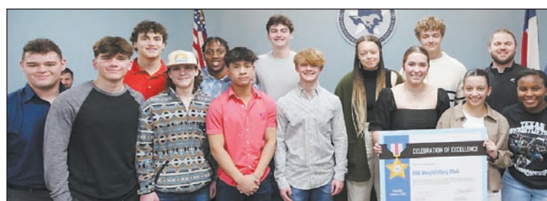
FHS WEIGHTLIFTING - STATE & NATIONAL QUALIFIERS