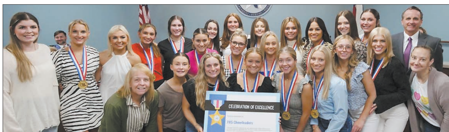
FHS CHEER STATE CHAMPIONS

Friendswood Library Classic Film Matinee for Friday, Feb. 24 is "The Awful Truth" with Cary Grant and Irene Dunne. The movie starts at 1:30pm at 416 S. Friendswood Dr. Free to public.