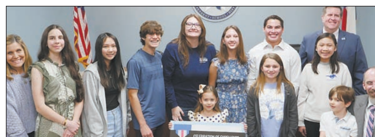
RODEO ART WINNERS