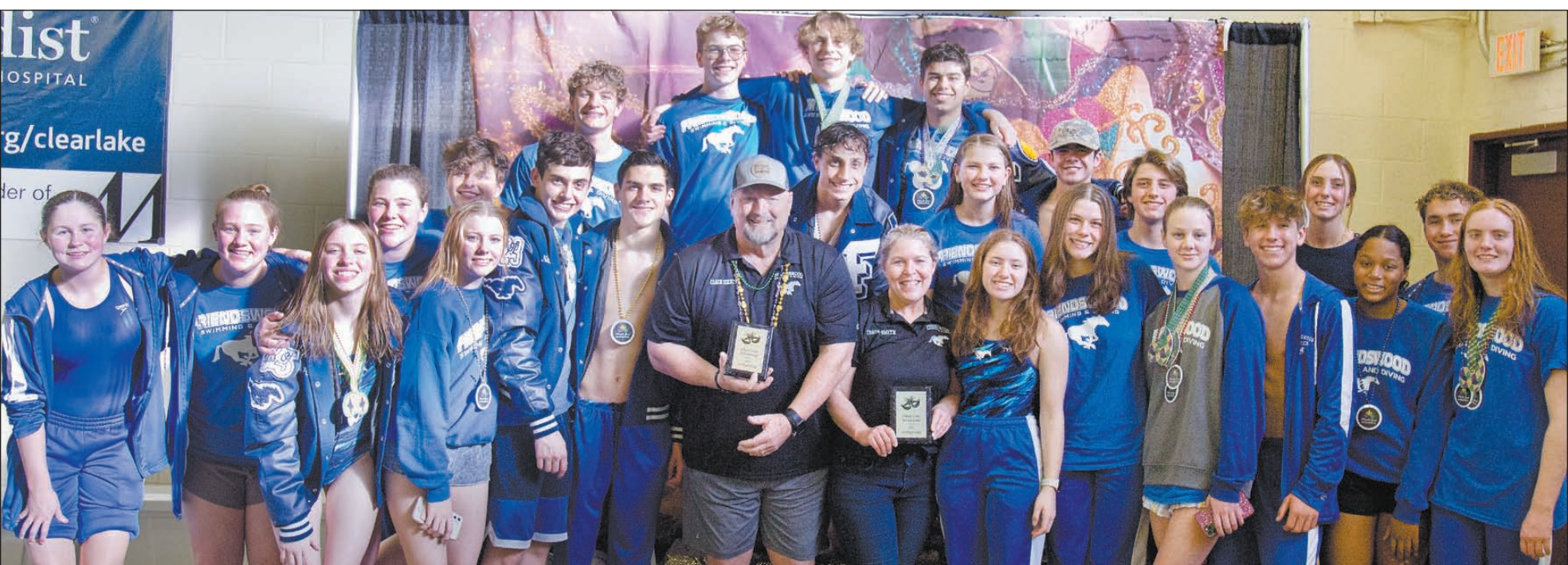
Friendswood Mustangs girls and boys Swim & Dive Teams captured first place against eight schools at the Clear Creek Mardi Gras Invitational. The Friendswood girls scored 293 points to finish in first place while the Friendswood boys scored 328 points to finish in first place.