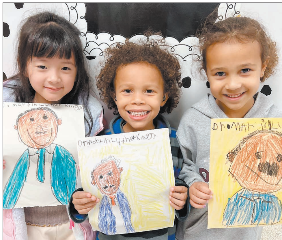
KINDERGARTNERS CELEBRATE MLK DAY Pearland ISD Lawhon Elementary kindergartner students learned about Martin Luther King Jr.'s legacy and created brightly colored artwork featuring MLK.

If you would like to invest in the future of FISD, you can make a tax-deductible gift to the endowment by joining FEF's Century Club or making a general donation today. Contact AAadair@fisd12.net or visit fef.myfisd.com/ways-to-give/century-club to learn more.