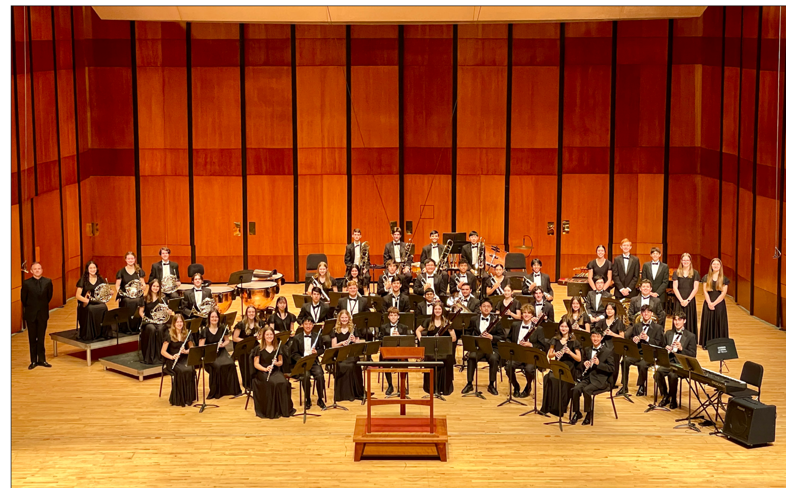
FHS Wind Ensemble poses for a photo at TMEA. The Wind Ensemble took 3rd place this year at the state competition.