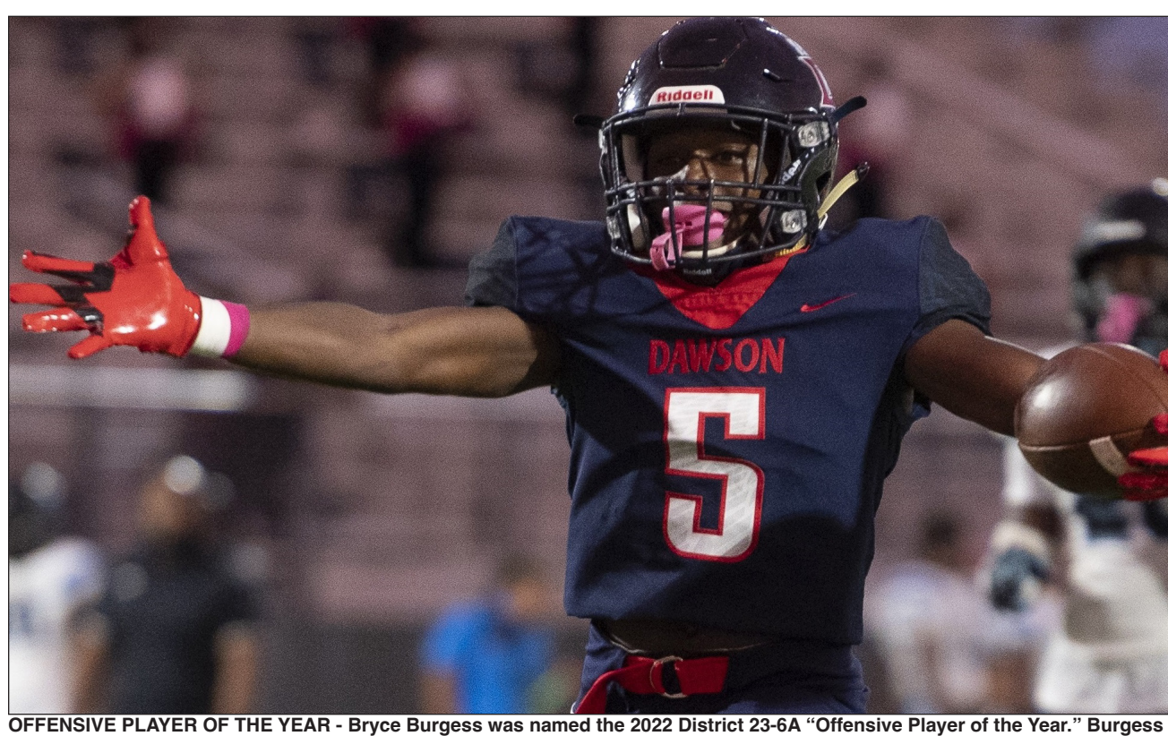
rushed for 1,023 yards on 141 carries (7.3 yards per carry) and scored 16 touchdowns while he also caught 21 passes for 164