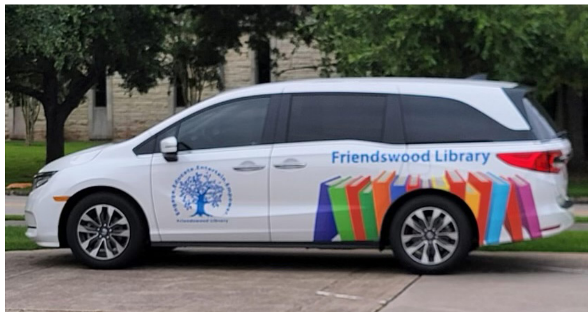
The Friendswood Library Book Mobile, currently on display outside the library. The Book Mobile will be used to make deliveries for homebound residents as well as outreach events like the 4th of July.

The next Library Gala will be held this year on September 30th and the theme for this year is Through the Looking Glass. Tickets go on sale at the end of the month through the library website, www.friendswood.lib.tx.us . Tickets are $100 per person.