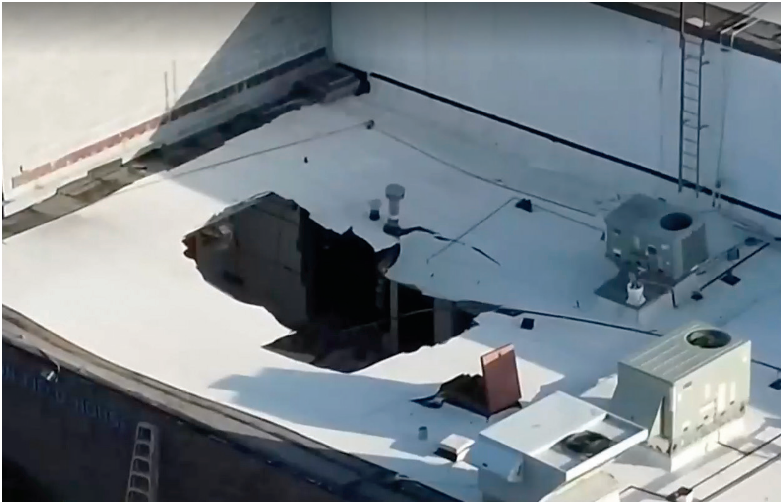
An aerial photo of the collapsed roof over the Boys' Gym at Friendswood High School where four construction workers were injured. The school is currently closed for an accident investigation by the Occupational Safety and Health Administration (OSHA).

Tragedy struck Friendswood High School last week when the roof of the Boys' Gym collapsed under the feet of four construction workers.