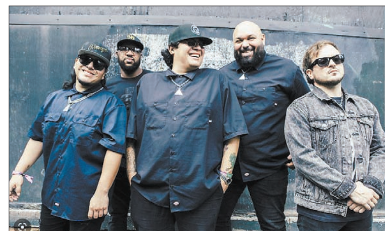
Giovannie and the Hired Guns will perform April 22 at the Galveston County Fair & Rodeo at Jack Brooks Park in Hitchcock. To purchase tickets go to https://tickets.galvestoncountyfair.com/p/tickets .

To get tickets for the concerts, go to https://tickets.galvestoncountyfair.com/p/tickets .