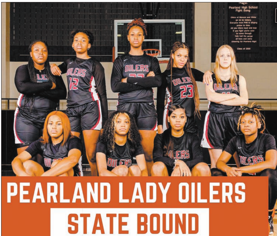
PEARLAND LADY OILERS STATE BOUND