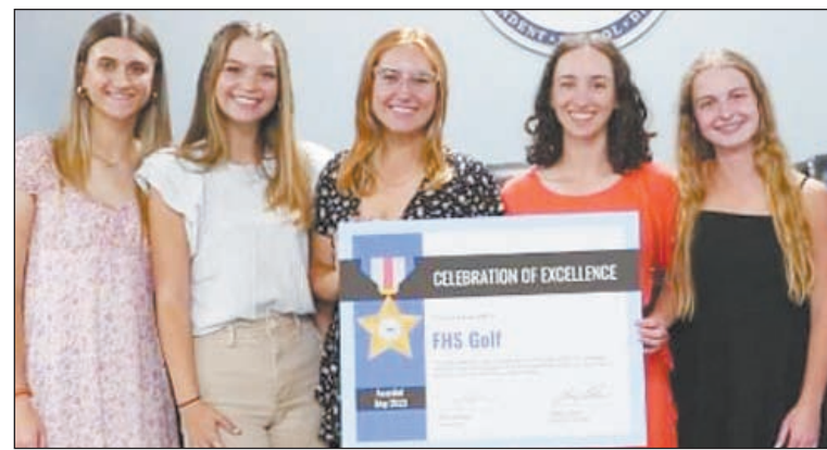
FHS Girls Golf members who competed in State were honored during the Monday night school board meeting.