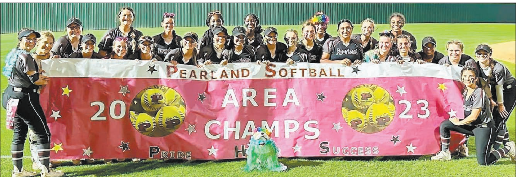
LADY OILERS ADVANCE - The No. 4 state-ranked Pearlland Lady Oilers swept Summer Creek to advance to the Class 6A Region III quarterfinals. The Lady O's improved to 33-3 and are set to face the Kingwood Lady Mustangs in a best-of-three series.