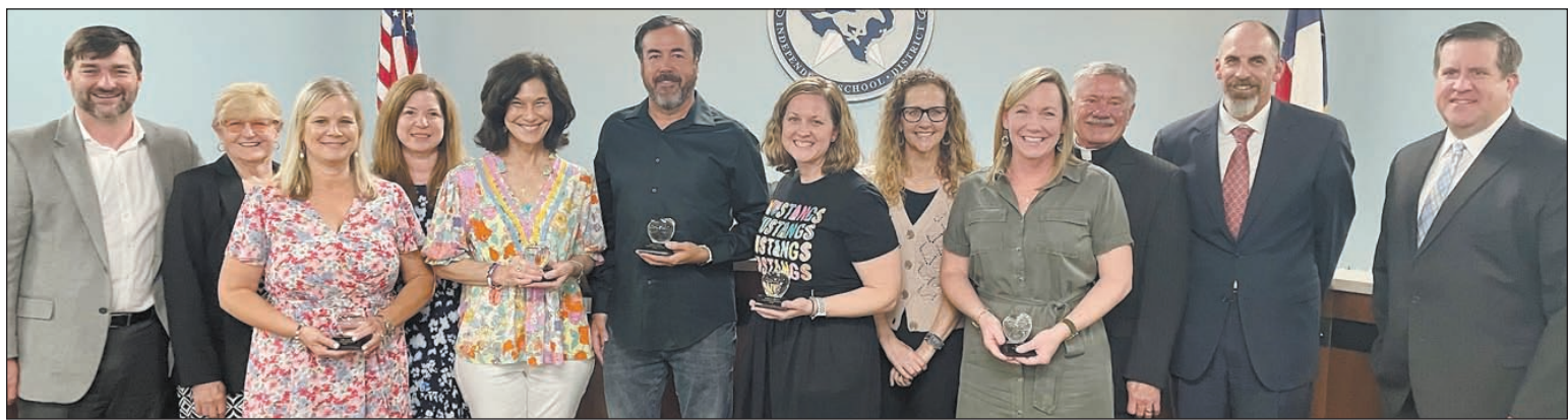
Friendswood ISD School Board members and superintendent pose with the 2023 Teachers of the Year. The group was honored at the Board meeting May 8.