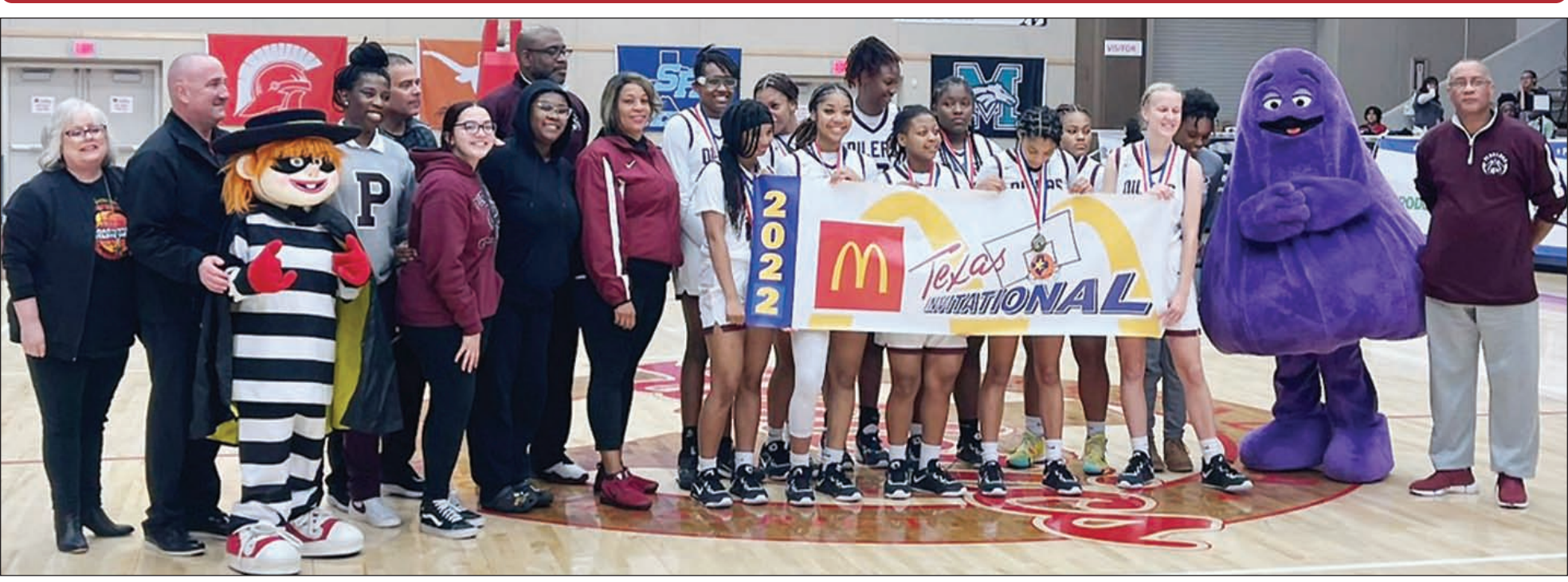
Lady Oilers win Gold Division of the McDonald's Texas Invitational - The Pearland Lady Oilers beat Cibolo Steele (52-33), Cy-Fair (40-24), San Antonio Johnson (47-45), Converse Judson (54-52), and Summer Creek (46-39) for the McDonald's Texas Invitational title. The No. 6 state-ranked Lady Oilers are now 12-1 on the season.