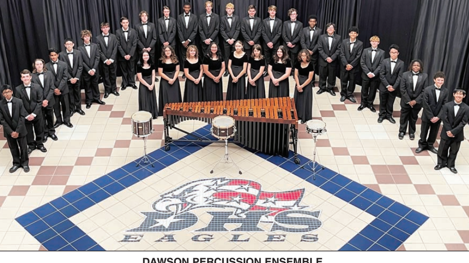
DAWSON PERCUSSION ENSEMBLE