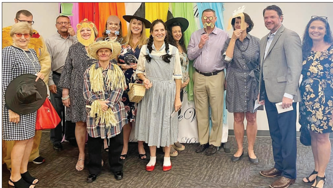
Friendswood Rotarians pose with members of the Hope Village Rotaract Club. Friendswood Rotary Club was awarded a "Circle of Friends" community award for their continued support of Hope Village.