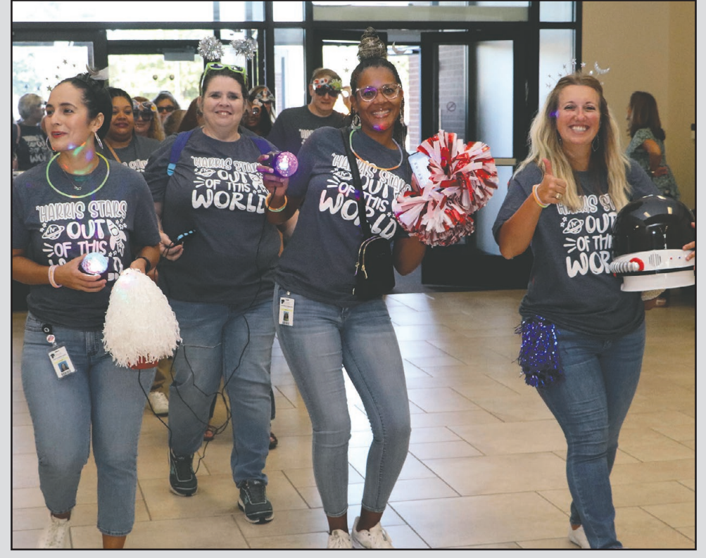
Staff from CJ Harris Elementary cheer and dance for the new school year ahead at Pearland ISD's annual convocation held on Aug. 8.