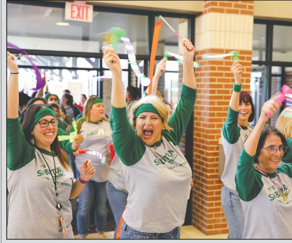
Sablatura Middle School staff celebrate the beginning of a new school year at Pearland ISD's annual convocation held on Aug. 8.