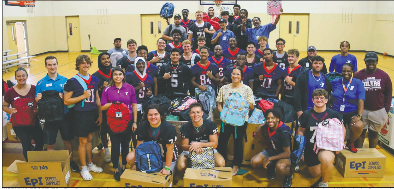
WORKING TOGETHER - The Dawson Eagles and the Pearland Oilers came together for one cause to help pack backpacks for the children in the Pearland community at the Vic Coppinger Family YMCA's Operation Backpack. Two Schools - ONE COMMUNITY - FAMILY!