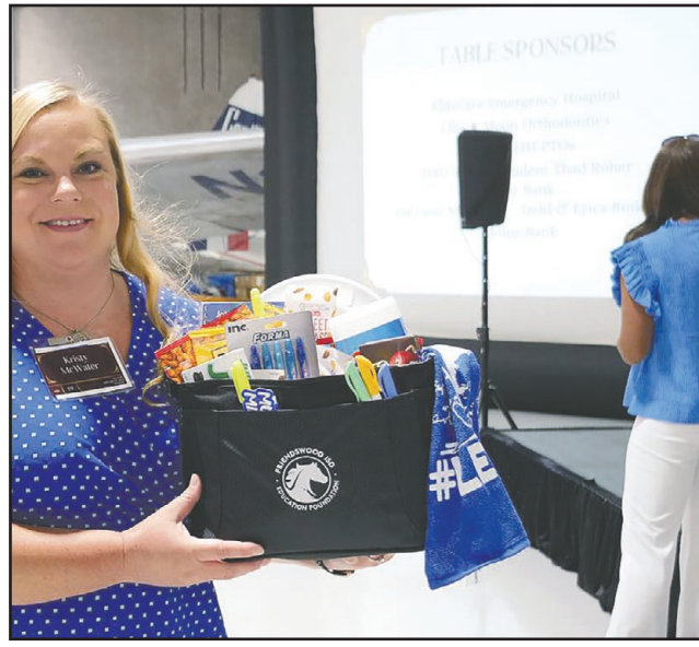
The afternoon was packed with delicious food catered by Outback Steakhouse, vendor tables, goody bags full of treats donated by local businesses and a record-breaking

Dozens of businesses and individuals stepped up to sponsor including longtime Title Sponsor Gulf Coast Educators Federal Credit Union.