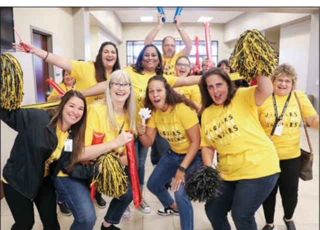
Jamison Middle School staff celebrate the beginning of a new school year at Pearland ISD's annual convocation on Aug. 11.