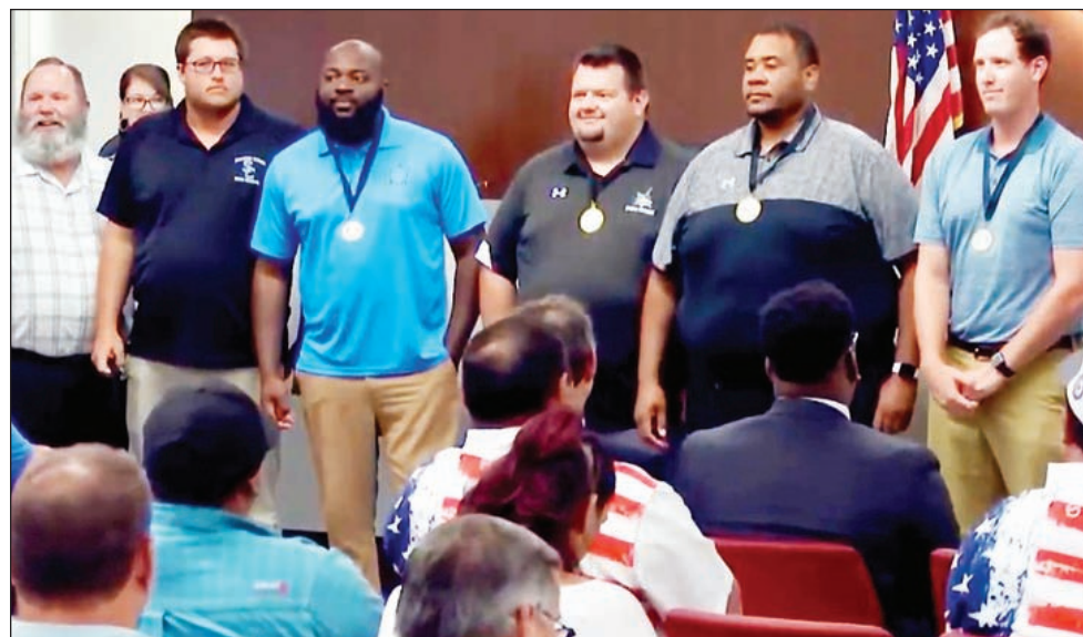
Members of the Shadow Creek Ranch High coaching staff are honored by Alvin ISD trustees for their quick actions after a student collapsed at a June strength camp. That student is expected to make a full recovery.

For additional information, call Customer Service at 281-652-1603.