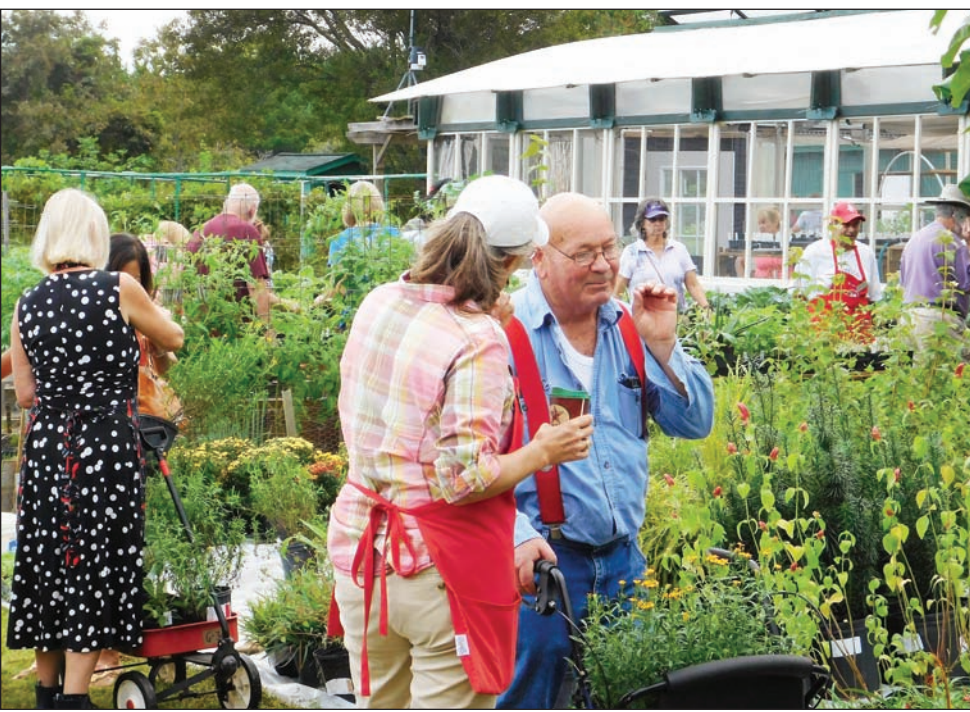
The Master Gardener Discovery Garden in La Marque will be the site for a huge plant sale with Master Gardener grown items, fall vegetables, herbs, Louisiana Irises, hardy hibiscus and crafts.