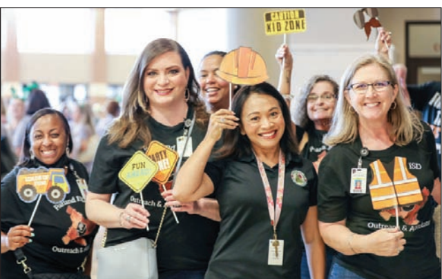
Staff from Pearland ISD's Outreach and Attendance Department wore themed shirts displaying "Build Pearland Proud".