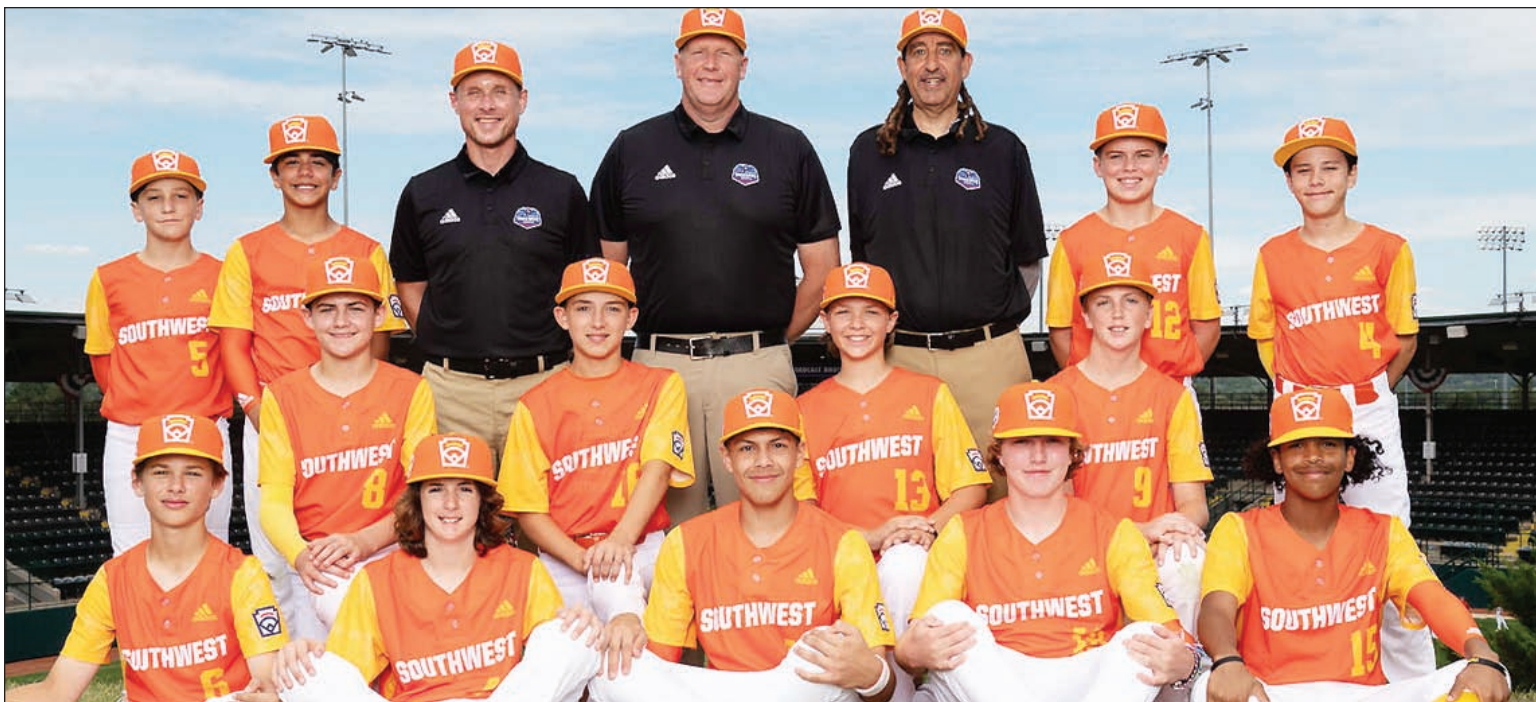
PEARLAND 12U ALL-STARS

Book Club will discuss "Guns, Germs and Steel" by Jared Diamond at 11 a.m. in the Lone Star Room of the Melvin Knapp Activity Center, 2424 Park Avenue. For information, call 281-652-1809.