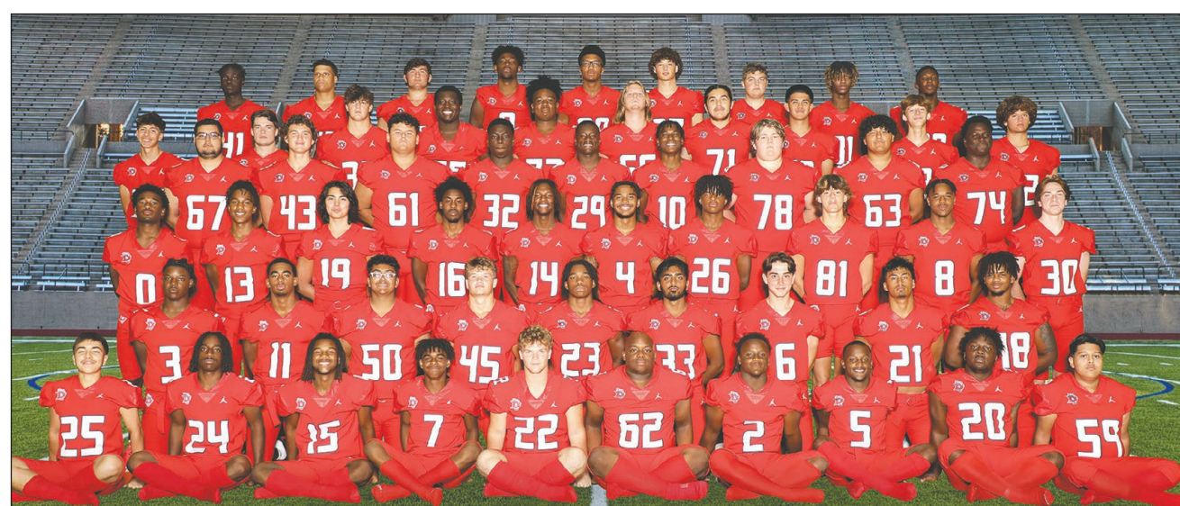
Dawson High School 2023 Football Team

This game should be a great season-opener for both teams Prediction: Hightower 28 - Dawson 17