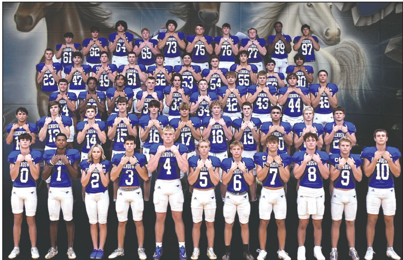
Friendswood High School 2023 Football Team

Prediction: Friendswood 24 - Texas City 21