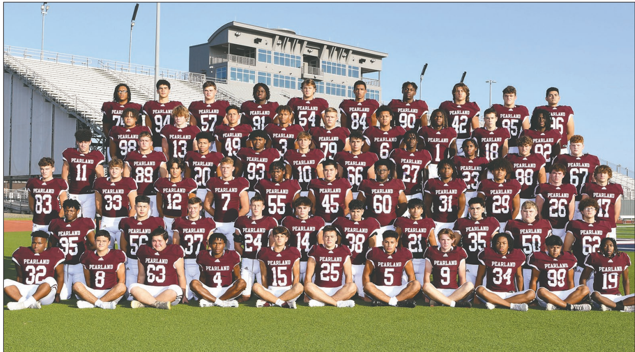
Pearland High School 2023 Football Team

Another underlying issue that was drastically evident in