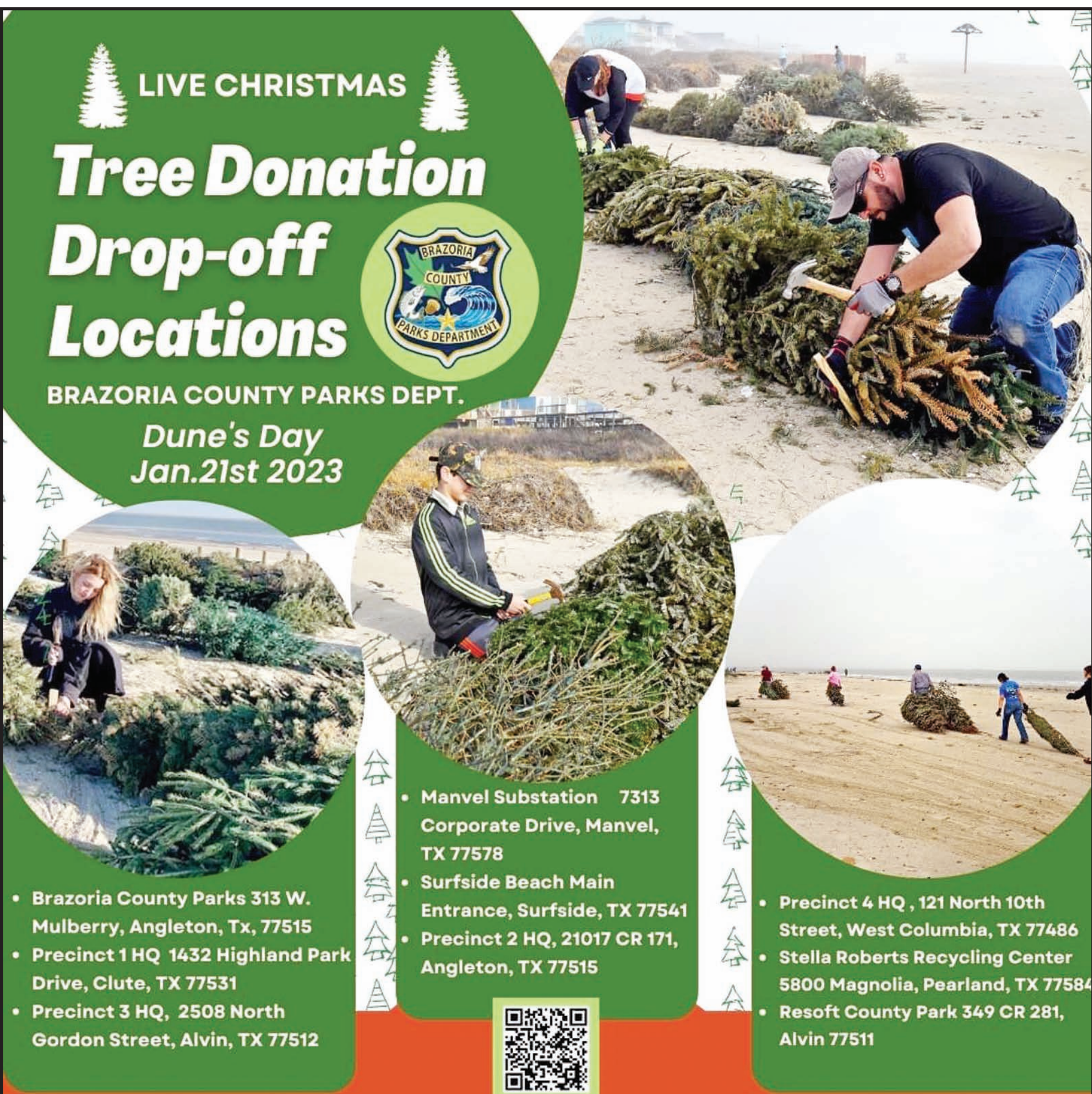
Brazosport area volunteers move recycled Christmas trees onto the coastline as part of the annual Dunes Day project. This year's Dunes Day is scheduled Jan. 21.