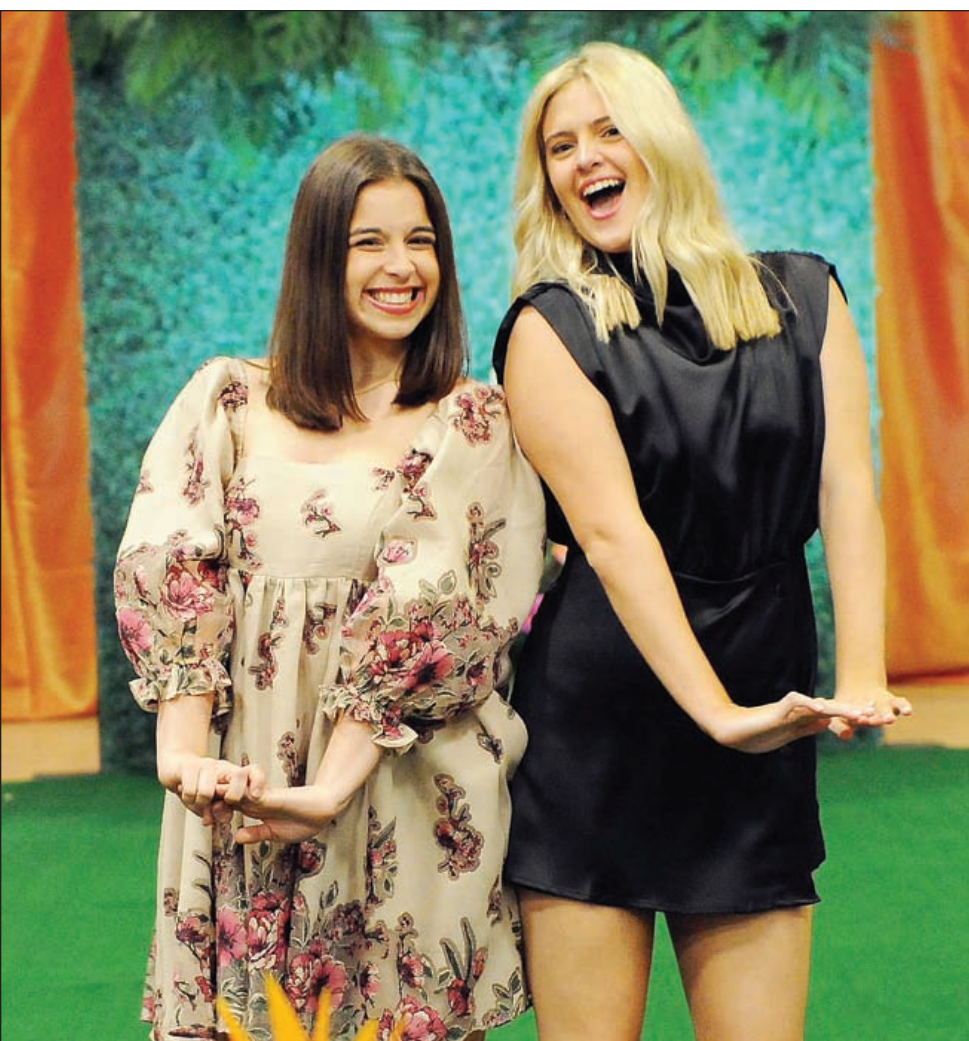
FHS Class of 2023 students participated in the 5th Annual Friendswood High School Senior Style Show held recently at First Baptist Church.