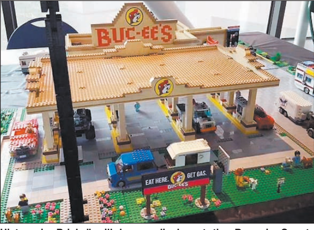
"History in Bricks" will be on display at the Brazoria County Historical Museum, 100 East Cedar in Angleton, beginning Feb. 18.