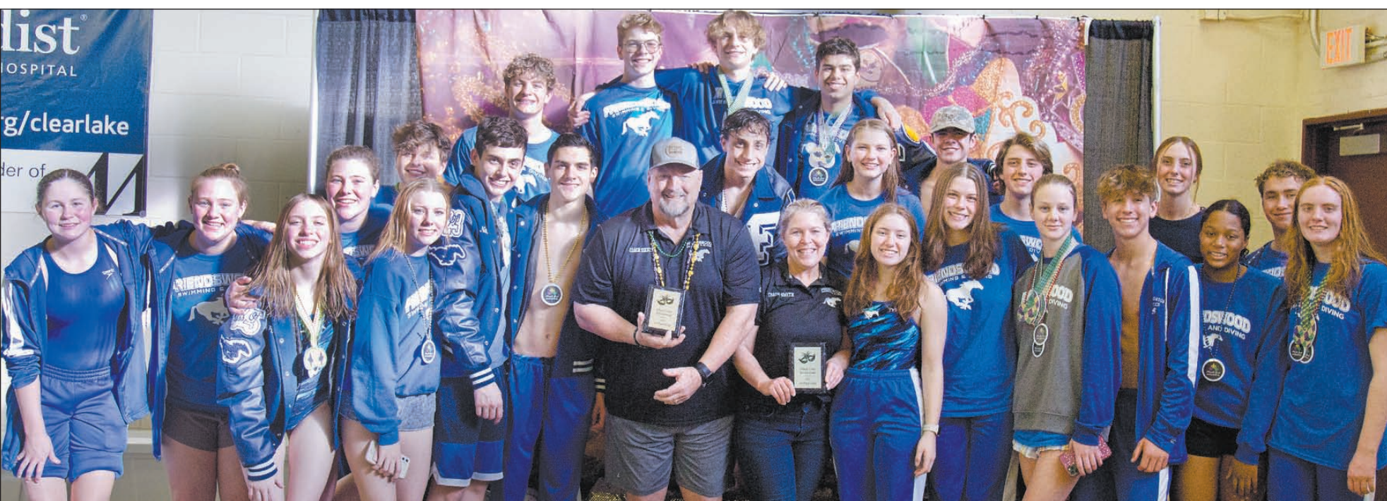
Friendswood Mustangs girls and boys Swim & Dive Teams captured first place against eight schools at the Clear Creek Mardi Gras Invitational. The Friendswood girls scored 293 points to finish in first place while the Friendswood boys scored 328 points to finish in first place.