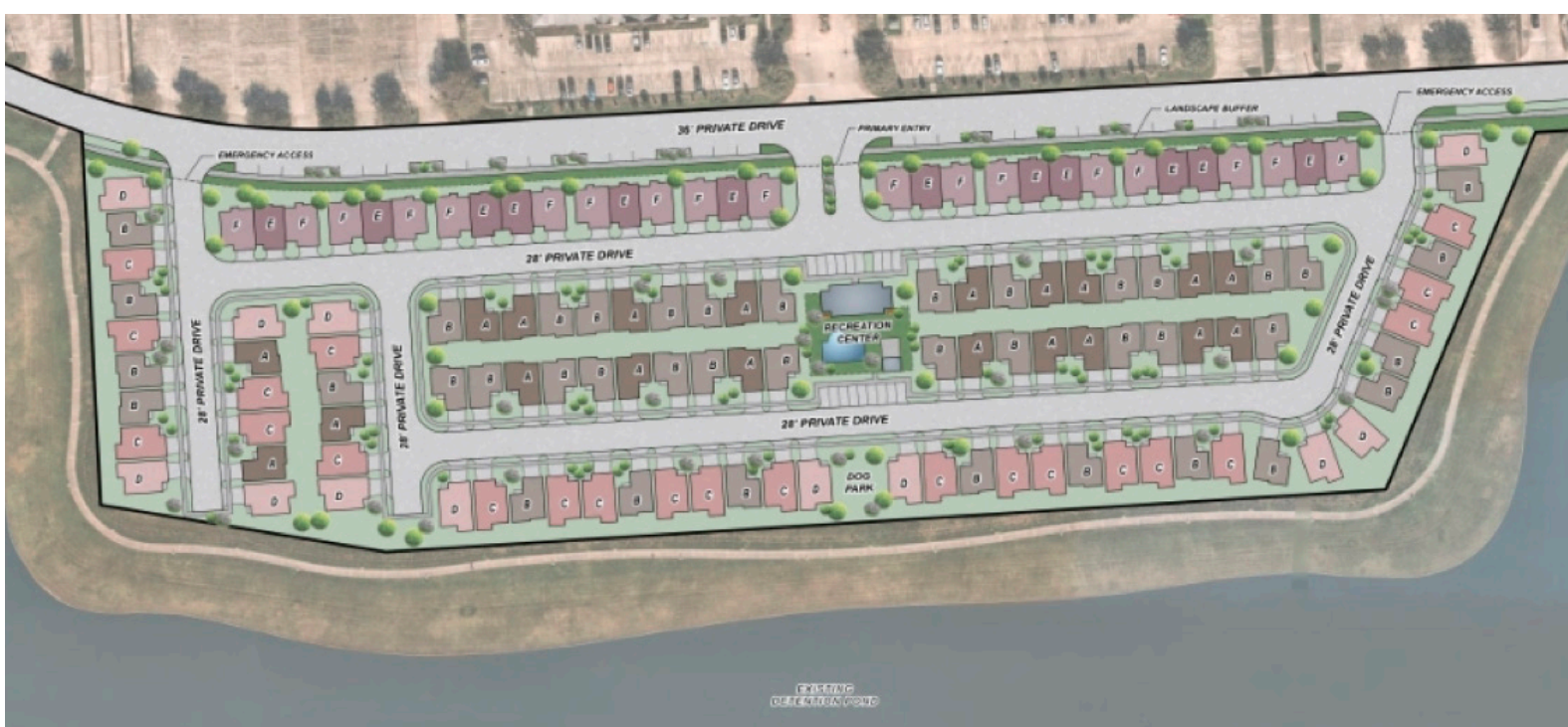
A conceptual site plan for the LightHaven multi-family development at Pearland Town Center which was the subject of discussion at the joint workshop between City Council and the Planning & Zoning Commission.

Clayton FUNERAL HOME AND CREMATORY 5530 W. Broadway • Pearland 281-485-4446 www.claytonfuneralhomes.com