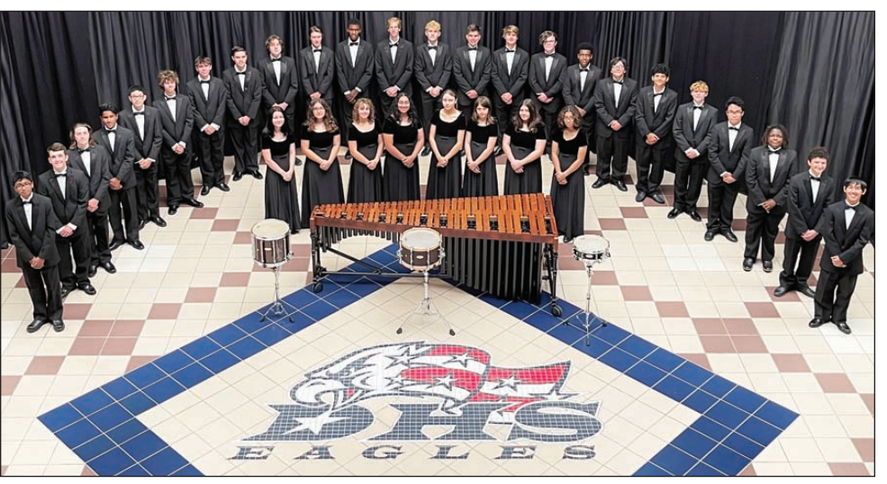
DAWSON PERCUSSION ENSEMBLE

An issued statement addressing the allegations stated "There are existing systems in place to ensure the fairness of our national competitions and as such we have begun an active review into this situation."