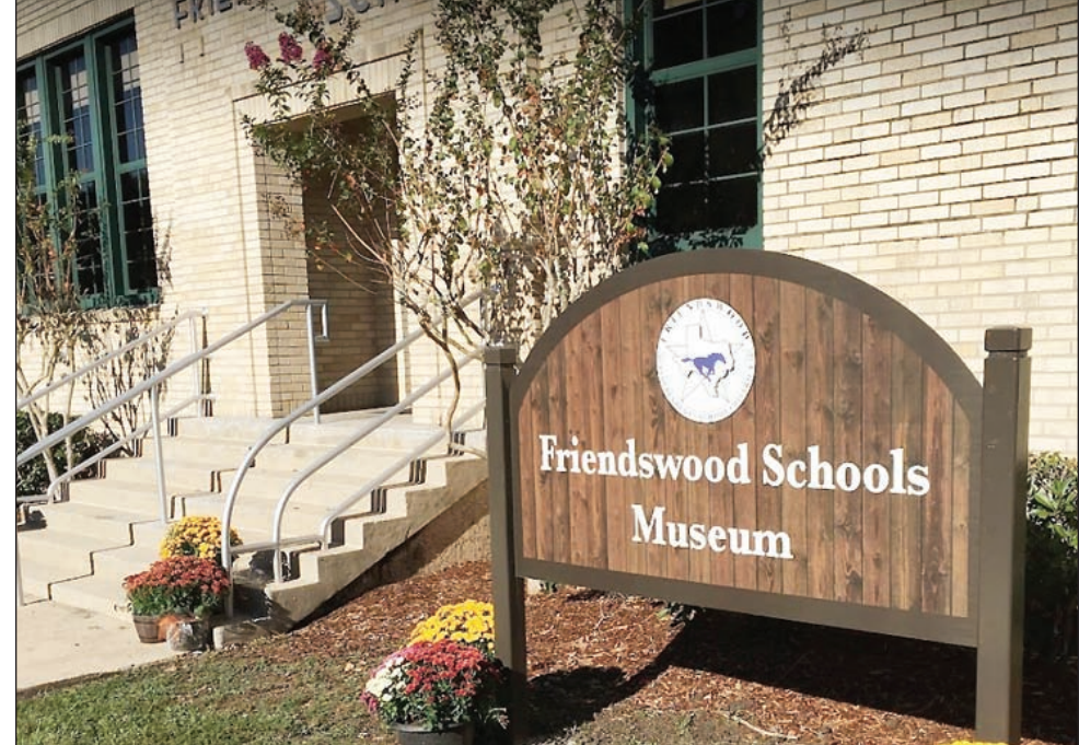
FRIENDSWOOD SCHOOLS MUSEUM