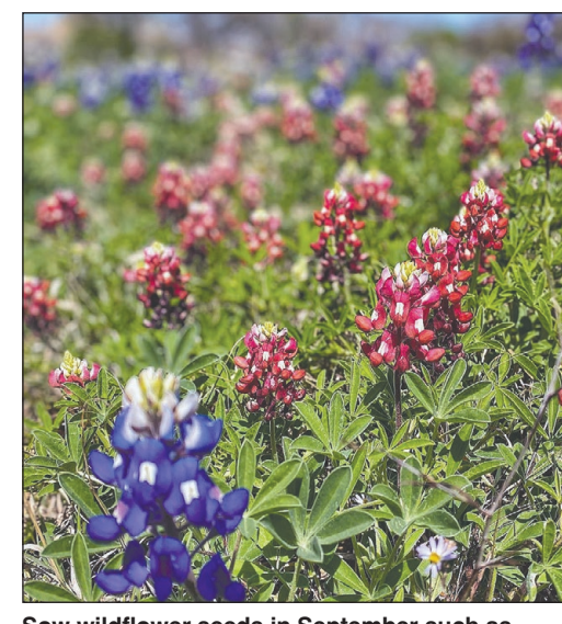
Sow wildflower seeds in September such as bluebonnets. The new maroon bluebonnet is just the thing for Aggies who garden in the area

Keep watch for any pests and/or diseases on plants. Early treatment can aid in ending a problem that could have grown into an infes-