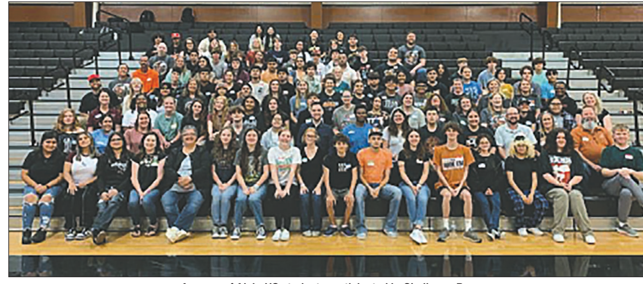
A group of Alvin HS students participated in Challenge Day.

For millions of young people, teasing, violence, and alienation are a part of a typical school day. Many students are afraid to walk down the halls for fear of being teased or humiliated. Others feel so alone and frightened that they cannot even pay attention in their classes.