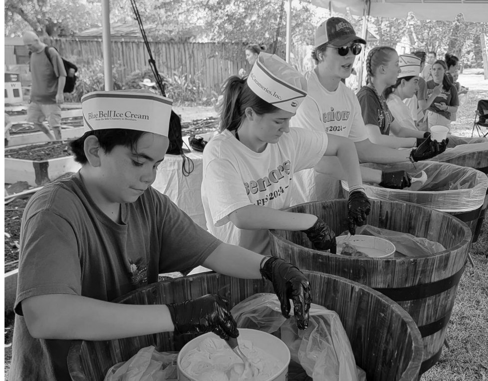
Student volunteers serve up free ice cream at the 8th Annual Ice Cream Social

As each year's event concludes, it leaves behind cherished memories and a reaffirmation of the strong bonds that unite the people of Friendswood. The Ice Cream Social promises more heartwarming celebrations to come, continuing to bring joy and togetherness to the community.