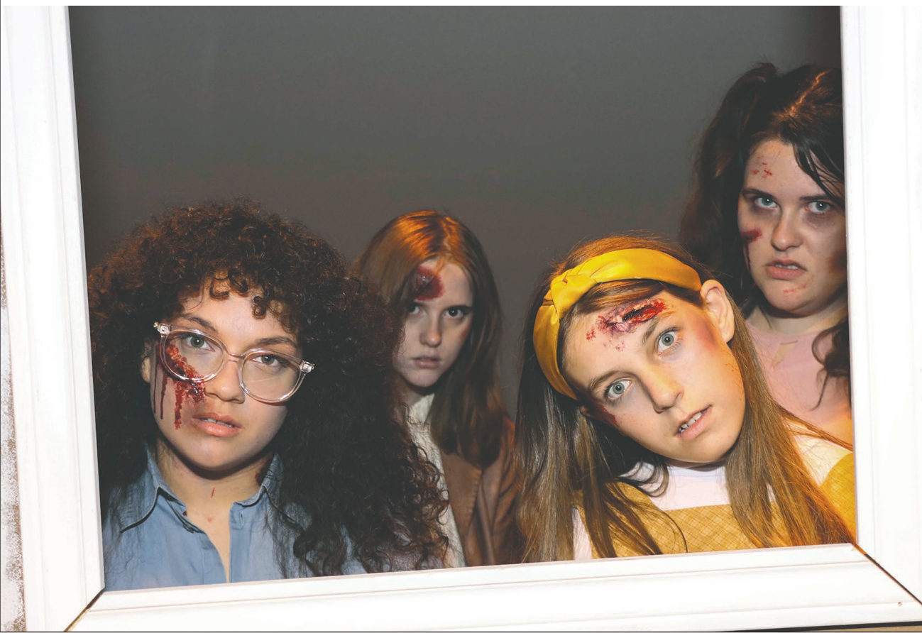
PHS Theatre presents "Night of the Living Dead" on Oct. 6 at 7 p.m. and Oct. 7 at 2 p.m. and 7 p.m. in the PHS auditorium.

Pearland High School Theatre presents "Night of the Living Dead"! A satellite probe sent to Venus brings back a mysterious radiation that transforms the dead into flesh-eating zombies. Seven people trapped in an isolated farmhouse must fight for survival as the zombies close in.