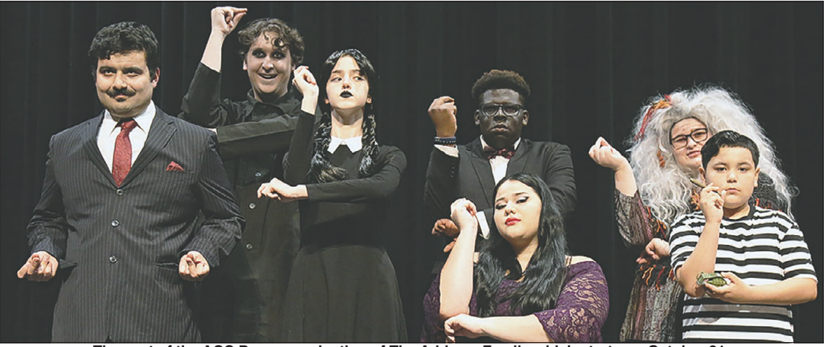
The cast of the ACC Drama production of The Addams Family which starts on October 21.