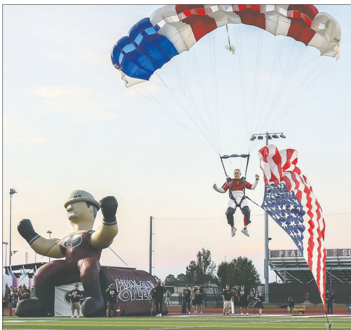
10th ANNUAL PEARBOWL - The Dawson Eagles and the Pearland Oilers will play one another in the 10th Annual PearBowl this Friday, October 13 at 7:00 p.m. at Pearland ISD Stadium. Dawson leads the series 5-4. Both teams enter the district showdown at 3-0 this year in league action with the winner moving atop the district standings. The Oilers are 5-1 overall and the Eagles are 3-3. Fans need to get to the game early as the Bayway Chevrolet Parachute Team will bring in the Game Ball, Texas Flag, and the American Flag (pictured) just prior the National Anthem. Bayway Chevrolet is the Game Sponsor of the PearBowl each year.

GUIDED HIKES Delores Fenwick Nature Center offers a family-friendly guided hike for ages three and up from 9 a.m. to 10 a.m. at Clear Creek Trail at West Pearland Library. Cost is $10 per person. For information or to register, call 281-652-1960, or visit parks.pearlandtx.gov .